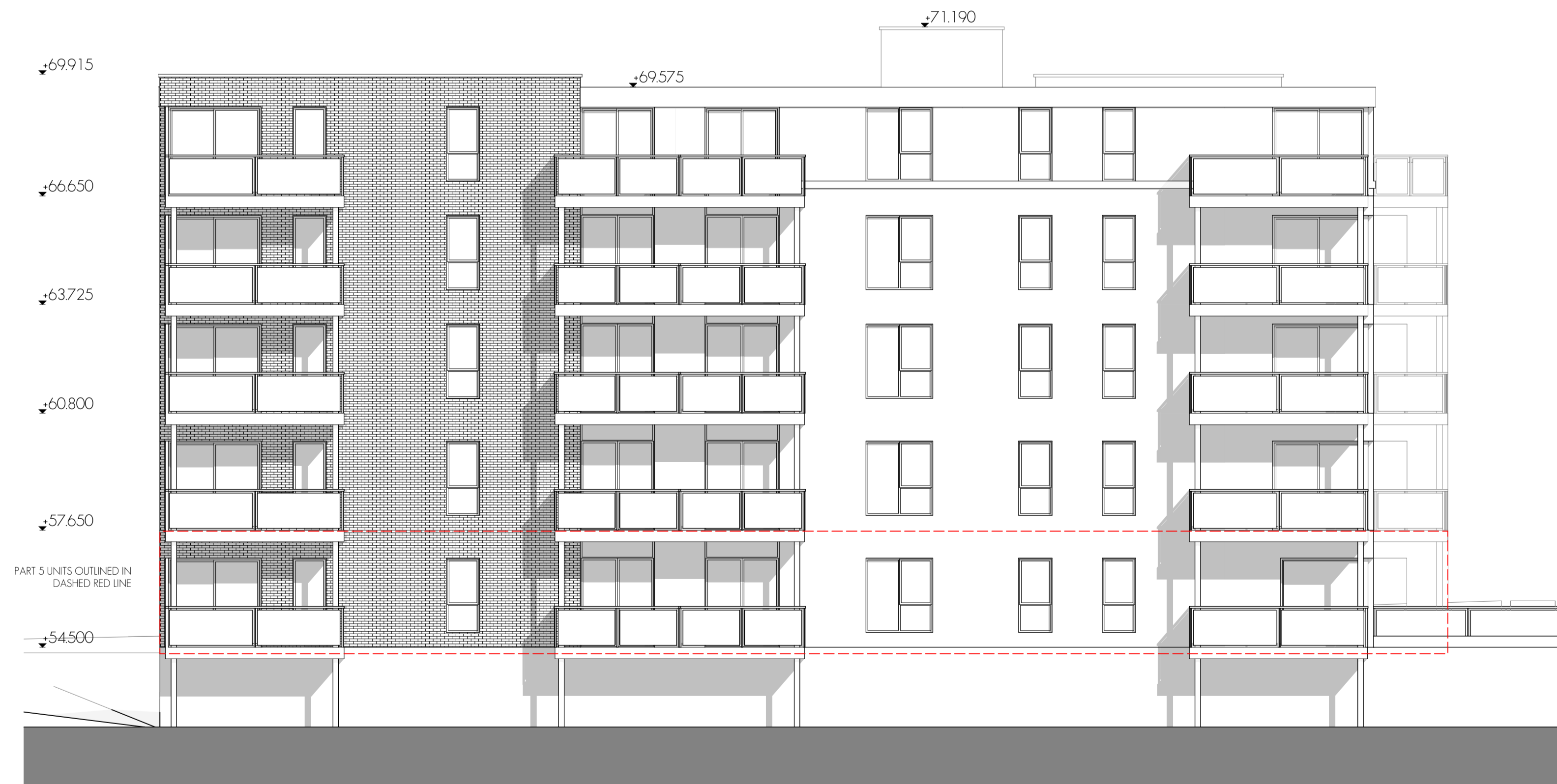
REAR ELEVATION (SOUTH) - BLOCK B 1:100