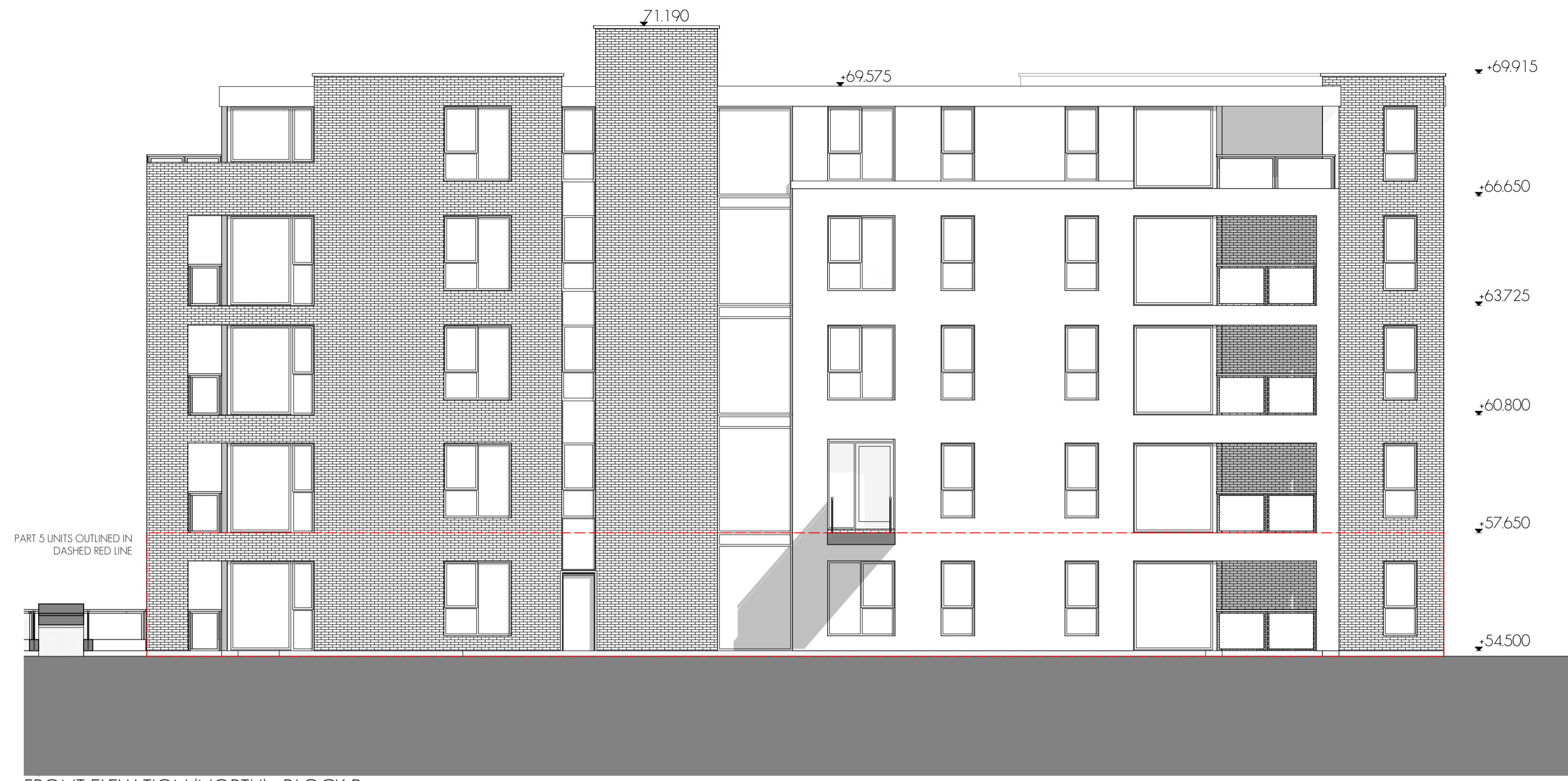
FRONT ELEVATION (NORTH) - BLOCK B 1:100

THIS DRAWING IS FOR PLANNING PERMISSION PURPOSES ONLY. FURTHER DRAWINGS AND STUDIES WILL BE REQUIRED FOR CONSTRUCTION AND TO ENSURE COMPLIANCE WITH RELEVANT BUILDING REGULATIONS AND STANDARDS. NOTE: Refer to 1:500 site layout drawings 18205-PLA-004, 18205-PLA-005, 18205-PLA-006, 18205-PLA-007, 18205-PLA-008, 18205-PLA-009 & 18205-PLA-010 for further details including all finished floor levels (FFL) & dimensioning.