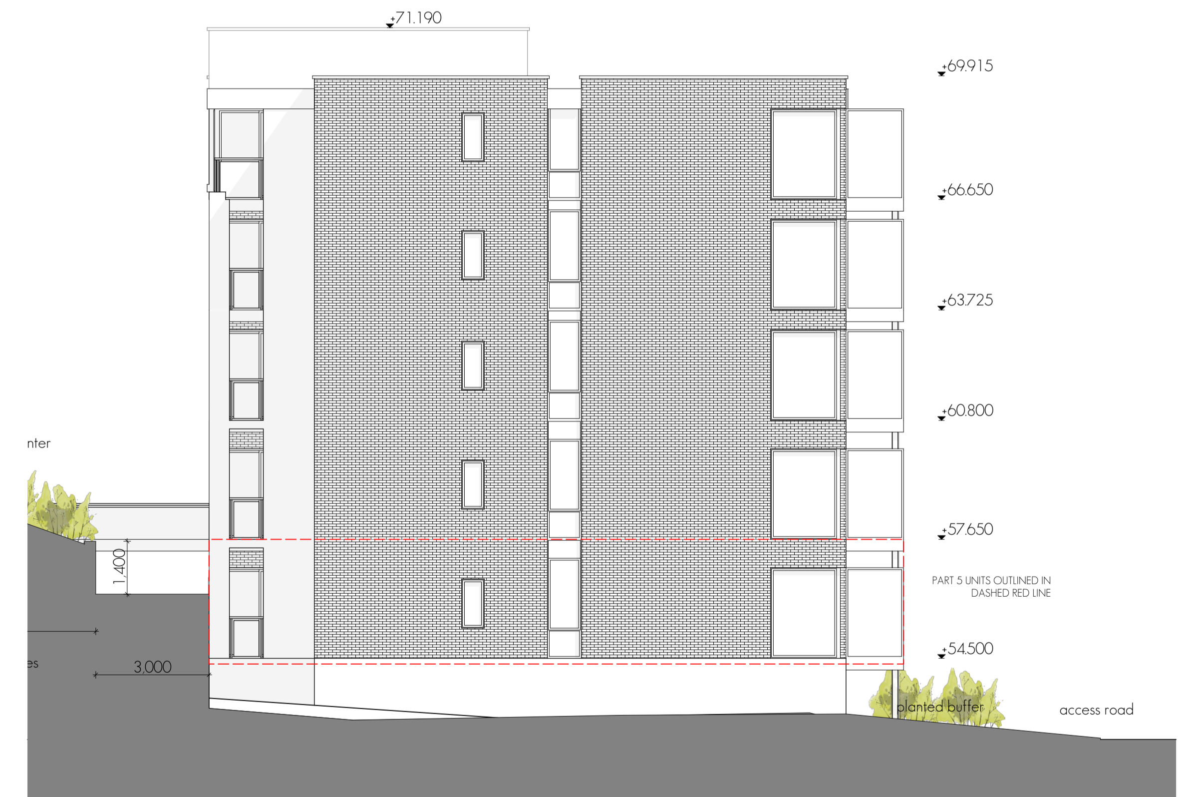
SIDE ELEVATION (WEST) 1:100